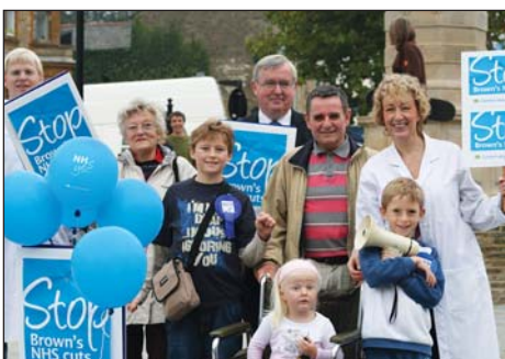
Campaigning against cuts in NHS services