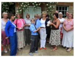
Fundraising event for Leonard Cheshire Homes, Tea for Ability, held in June 2009.