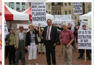
Protest against WNPJU proposals to build 40,000 new homes around South East Northampton.